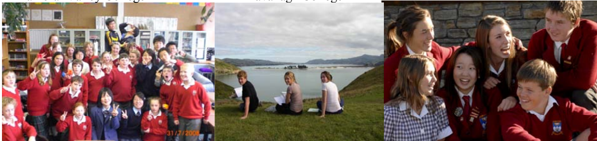
Dunstan High School