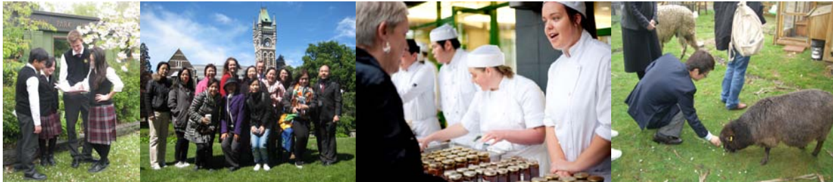
Logan Park HS

Today you will visit three institutions Logan Park High School, Kavanagh College, Otago Polytechnic and Otago University Language Centre and Foundation Studies. Visit Dun Eden Farm Park where you can interact with sheep, cows, horses, pigs, ducks, hens, turkeys and rabbits. Afterwards enjoy a Kiwi BBQ dinner with your hosts.