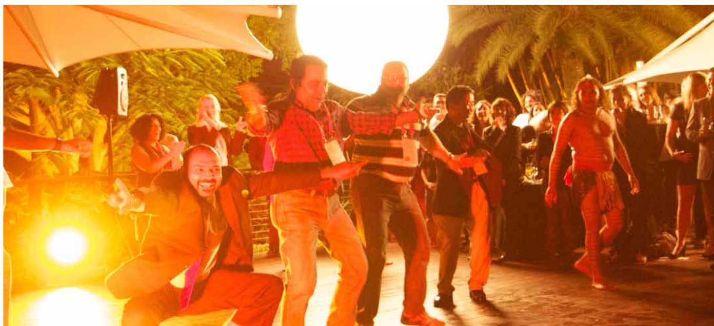
Participants enjoy dancing with The Nunukul Yuggera Yugimbir Nugi Aboriginal Dance Troupe