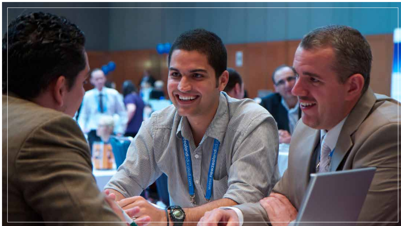
An educator-agent meeting

ANZA grows again in terms of size and quality